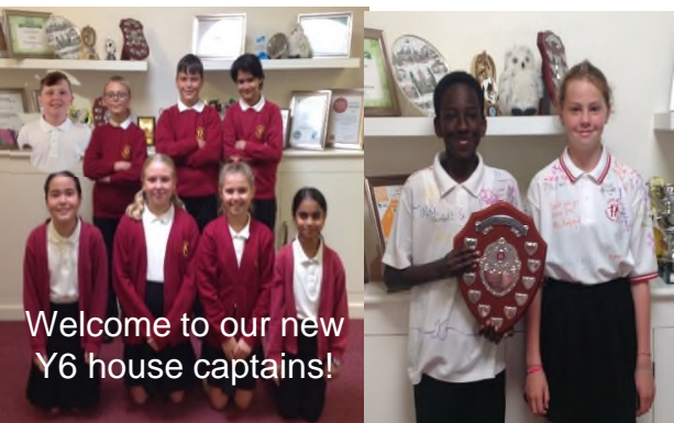
Welcome to our new Y6 house captains!